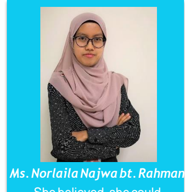
-She believed, she could, so she did-

THE PATH IS MADE POSSIBLE BY THE EFFORTS OF OUR EDITORS.