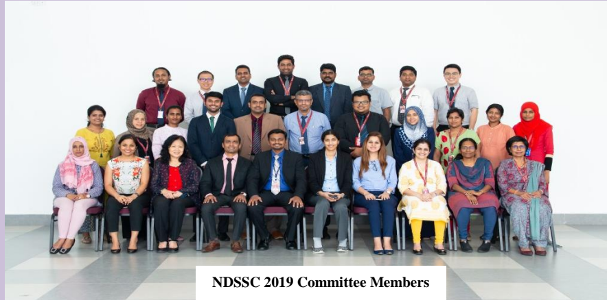
NDSSC 2019 Committee Members