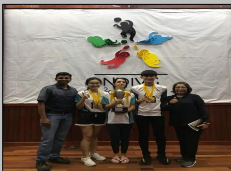
The best male and female athletes flanked by the Dean and Deputy Dean (Student Affairs) together with the University Representative

MAHSA University will be the host next year and this year's victory will go to show that here at MAHSA, we always try to Be More.