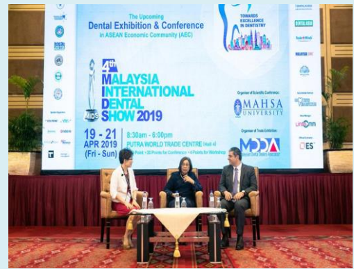
Case-Based Discussion by 3 renowned speakers on "When to Treat, Where to Refer"