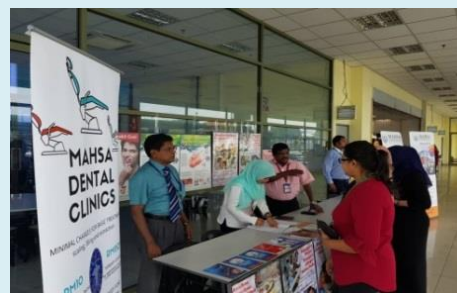
Table Clinic Exhibition

It was a good experience for the DSA's and Dental Technologist too.